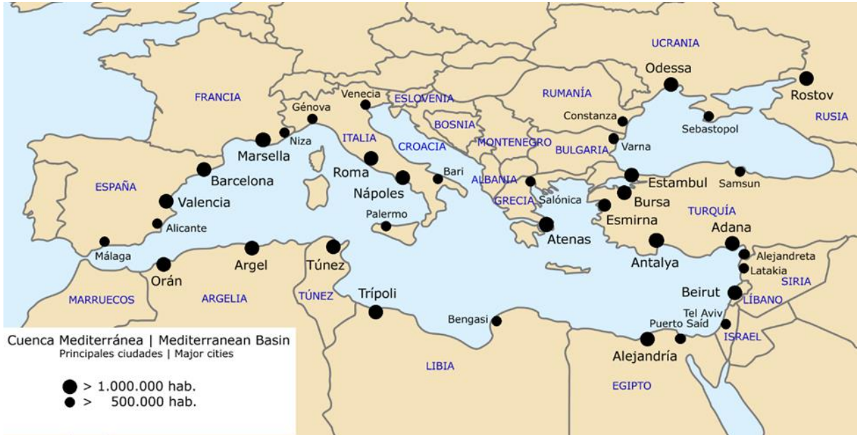
Figure 1. Map of the Mediterranean Sea and the Major cities around it.

(Hastaoglou-Martinidis, 2011). Each city narrates a tale of human settlement, adaptation and resilience; however, these narratives have often been ignored or insufficiently examined in scholarly works. The Journal of Mediterranean Cities seeks to address this lacuna by promoting an understanding of these urban settings.