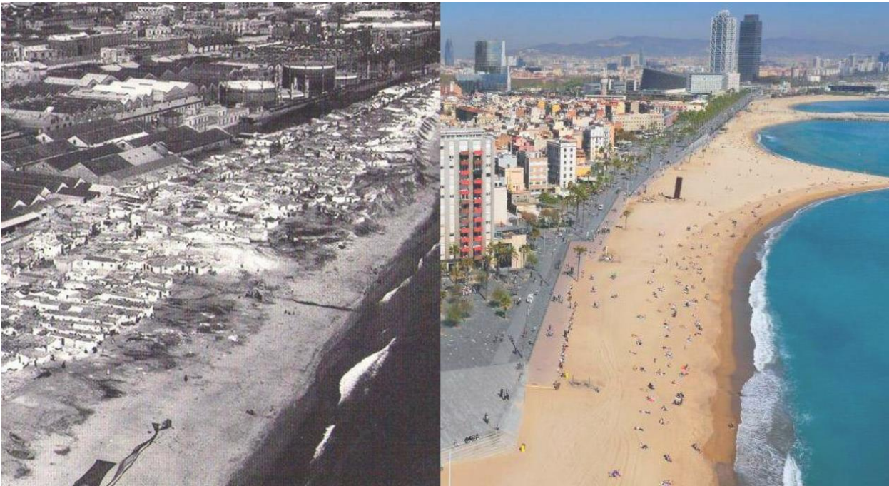
Figure 2. Barcelona's revitalized coastline.

The Mediterranean coast well known for its natural beauty is under threat from urban growth, pollution, rising sea levels, etc (Catalán, Saurí, & Serra, 2008). These issues are deteriorated by the region's popularity as a tourist hotspot often leading to development and harm to the environment. To revitalize these coastlines innovative eco-political governance is needed, incorporating studies on blue initiatives to support sustainable coastal communities in Mediterranean regions (Trombadore, 2020).