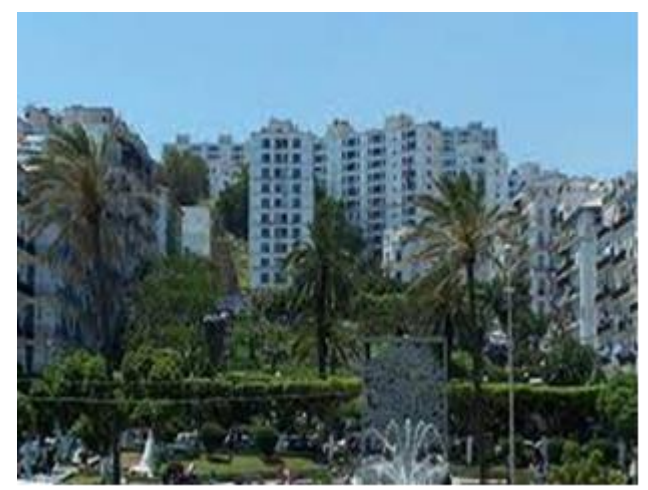
Figure 6. View of Taleb Abderrahmane garden