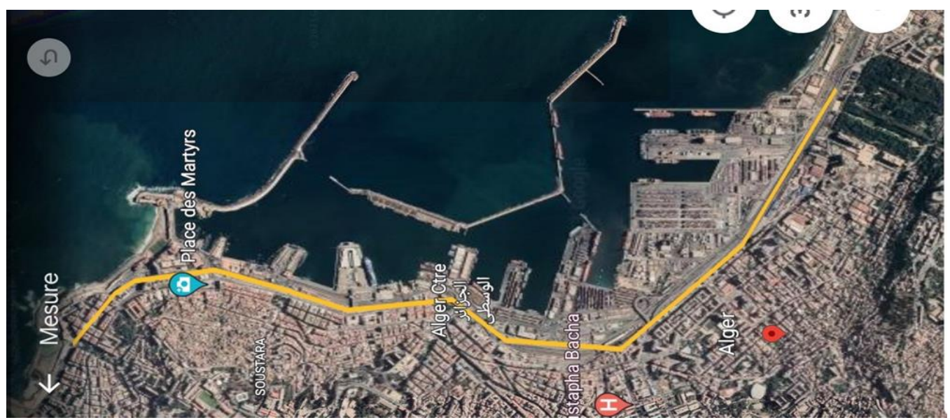
Figure 2. Context of study, 6 kilometre distance area on the Algiers bay

For the case of Algiers, the city possess many gardens, and got its first garden; le Jardin d'essai, Test garden in 1832, few time after in 1833 garden Maringo actually named Jardin Sofia took place at the western limit of Bab el Oued, another garden was erected in 1864 in Bab el Oued on a slopping site open to the Mediterranean sea was named le Jardin de la Ferrierre actually Jardin Taleb Abderrahman, the square port said in front of the national Theatre was edified in 1853, years later and after city walls destruction on the eastern direction of the old city le Jardin plateau des Gliere (actually les jardins de la grande poste) was edified in 1889. The early awareness of the importance of gardens in improving urban quality is felt through the city fabric organization, and the position of gardens within the district to which it belongs.