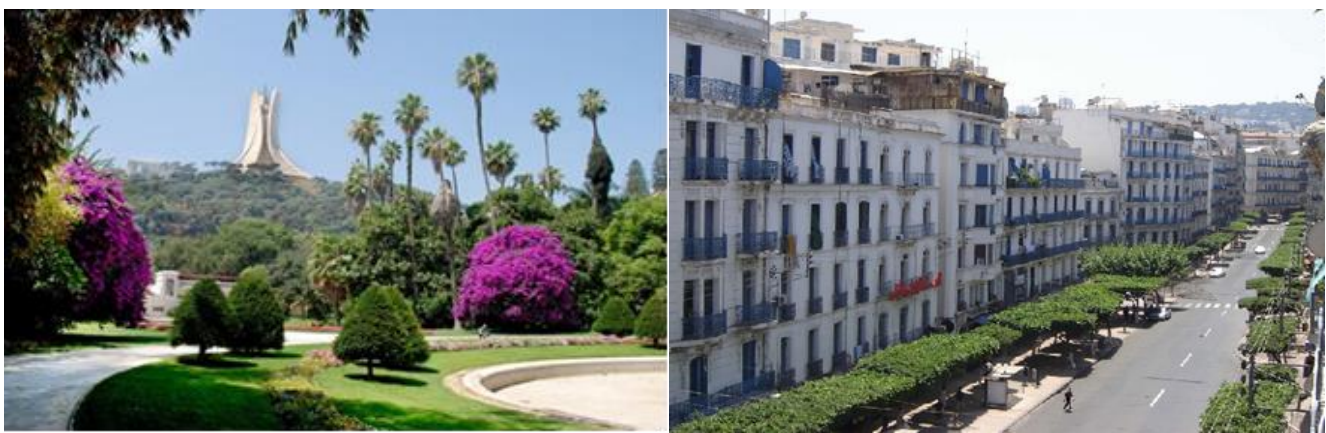
Figure 3. View of Jardin d'essai garden

The urban walls of rue Didouche are made up of buildings largely in the Haussmann style, some examples belonging to the art nouveau style, and art deco, built between 1900 and 1930. The size of the buildings reaches 20 meters high, the equivalent of five level with a last floor set back (Figure 4).