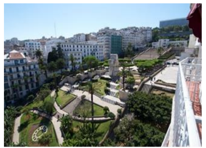
Figure 5. View of la Grande poste garden